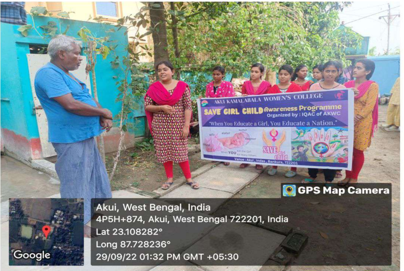
Save Girl child