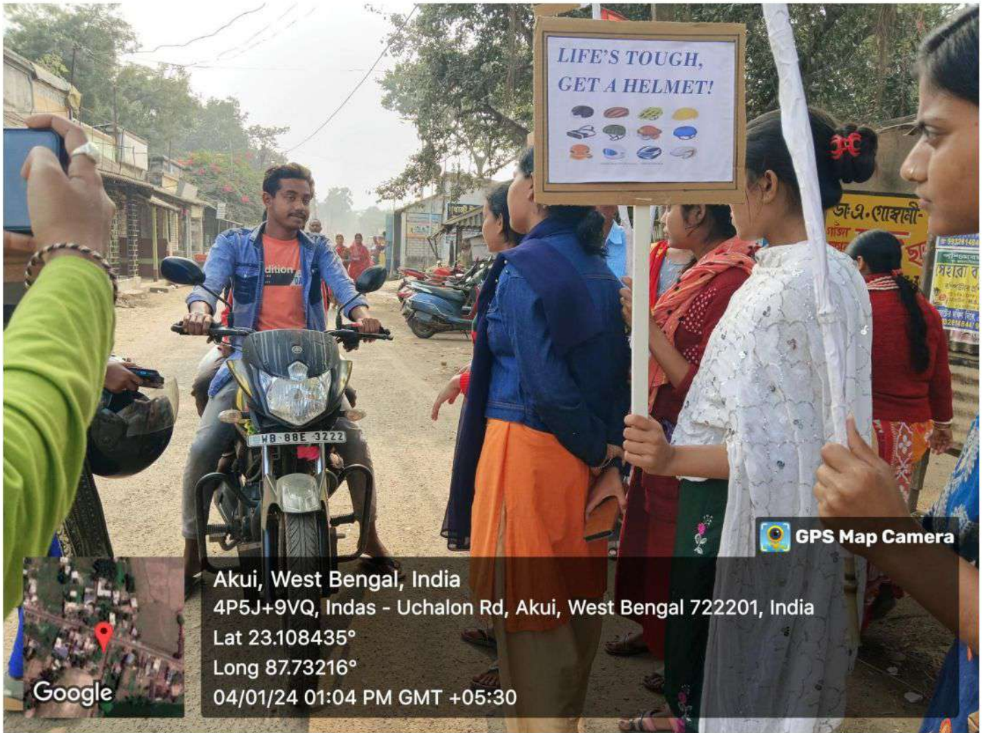
Safe Drive Save Life